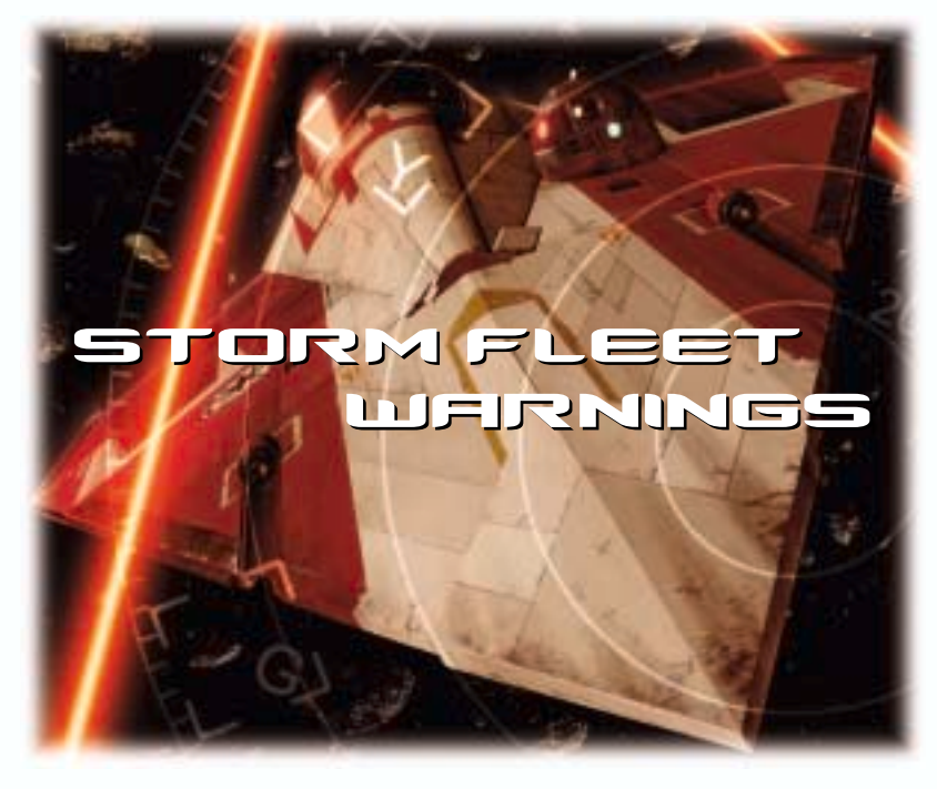
By Jude Watson

bi-Wan Kenobi and Anakin Skywalker were returning from a mission, heading back to the Temple by way of the Llon Nebulae. As they approached the Kronex spaceport, they had to reduce speed to minimum levels. Anakin drummed his fingers on the pilot seat. There was nothing worse than piloting an ultra-tweaked starfighter and having to go slow.