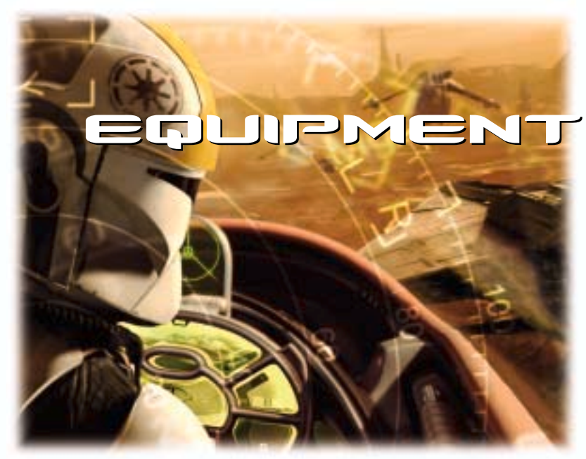
A Personal Account of the Sub-orbital Action at Haruun Kal, as reported by Auxiliary Heavy-Weapons Specialist CT-6/774.